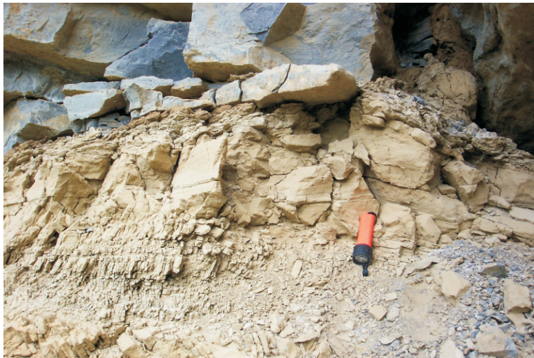
Glacial lacustrine deposits overlie a pebble till and fill the lower relict conduit to the ceiling