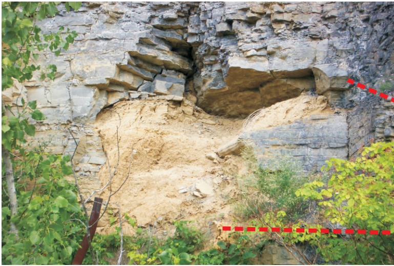
Lower relict conduit