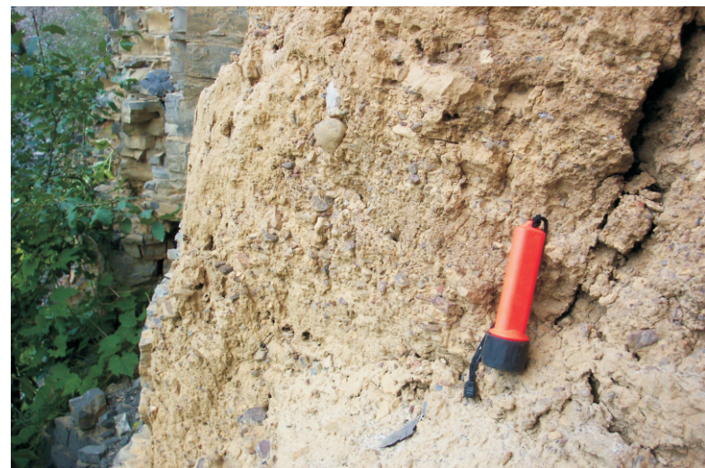
Chert-rich pebble till in the basal portion of the lower relict conduit