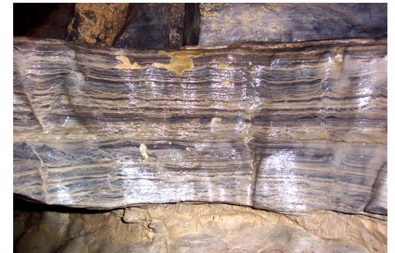
Crinkled Stromatolites in Silent Chamber

Bedrock Stratigraphy and Depositional Environments are now being documented and interpreted in Howe Caverns